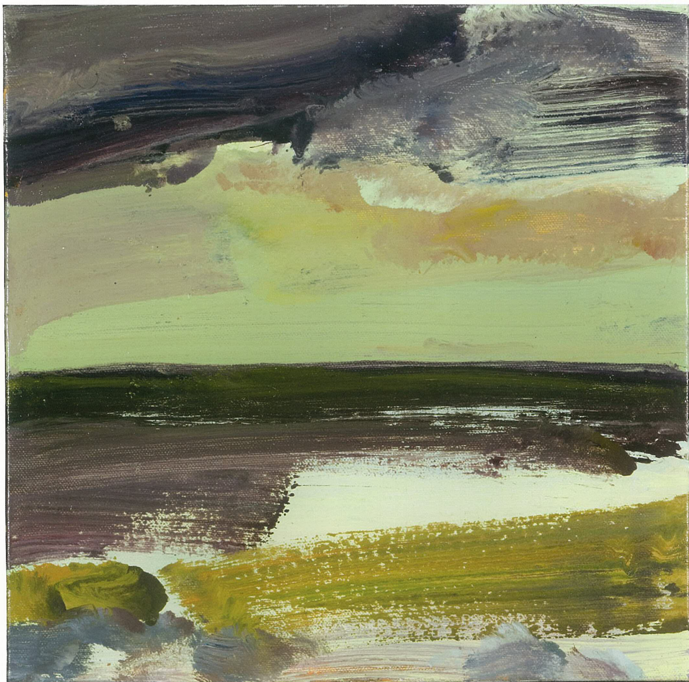
Pushing Light Gloucester, MA (Day Break Series), 2010, oil on canvas, 12 x 12

MFA, Massachusetts College of Art, 1994 • BFA, University of Massachusetts, 1990